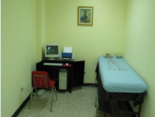
Facilities and equipment at the EEG lab of the Neurology Training Program office at Hospital Escuela.

Since it was installed, this EEG machine has been an invaluable tool both for the training of residents and to improve the standard of care with patients with altered consciousness states and epilepsy at the Hospital Escuela, more than 50 patients have been evaluated.